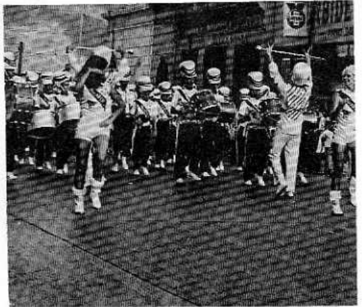
Brahma band kicked off its season early by performing at Monterrey Golden Aztecs first football game. Here, the band marches in a pre-game parade.

Freshmen enthusiasm for their "Howdy Freshman" privileges to free cold drinks after school Monday resulted in watered-down spirits. The Student Council, sponsor of the occasion, kept its free cold drinks promise, but unfortunately for the freshmen expecting to garner multiple cups of cokes, their faithfully worn blue ribbons only won them ice water.