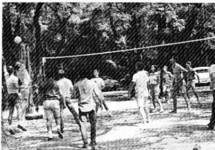
This racy game of volleyball was just one of the happenings at Brackenridge Park, May 14, where seniors held their annual fete. Paddle boat battles, people being pushed in the river, and the Park Ranger's stand are now mementos of the picnic.

5150 Broadway TA 6-0616 150 Terrell Plaza TA 4-3201 7403 Broadway TA 4-4561