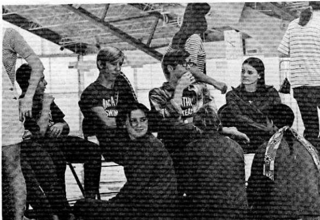
BOY — These swimming trips are nothing like the old Beta Club conventions.

Three Locations To Serve You 220 GPM Life Bldg, Central Park 1038 Basse Road 3331 Fredericksburg Road